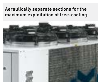
Aeraulically separate sections for the maximum exploitation of free-cooling.