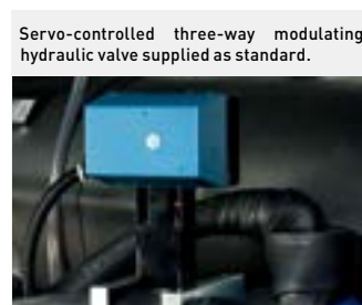
Servo-controlled three-way modulating hydraulic valve supplied as standard.