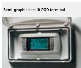
Semi-graphic backlit PGD terminal.